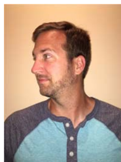
Turned to the left