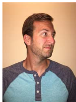
Turned to the right