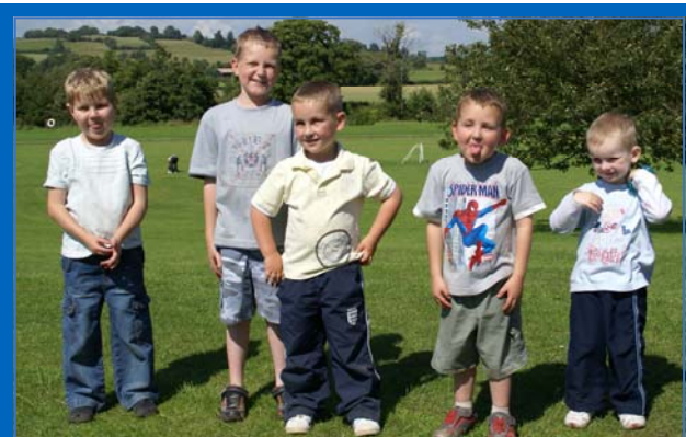
Boys with Barth syndrome often look deceptively healthy

Please consider this disease in any boy with cardiomyopathy of any form, muscle weakness, neutropaenia or hypoglycaemia, or in any family with a history of multiple male death in childhood.